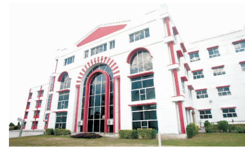
Global Public School, Kota