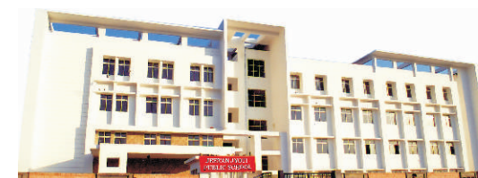
Jeevan Jyoti Public School, Jodhpur