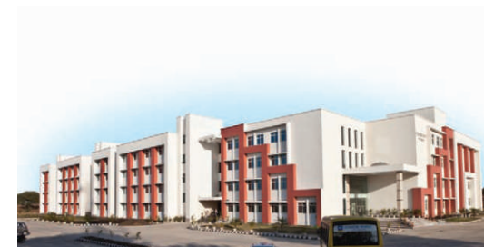
Career Point University at Kota, Rajasthan