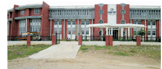
Career Point Technical Campus at Rajsamand, Rajasthan