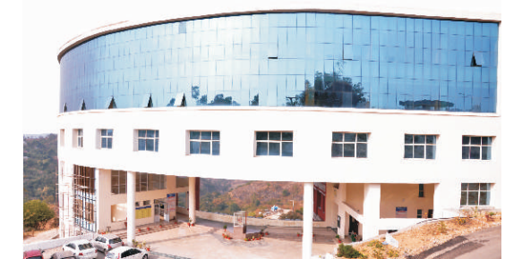
Career Point University at Hamirpur, Himachal Pradesh