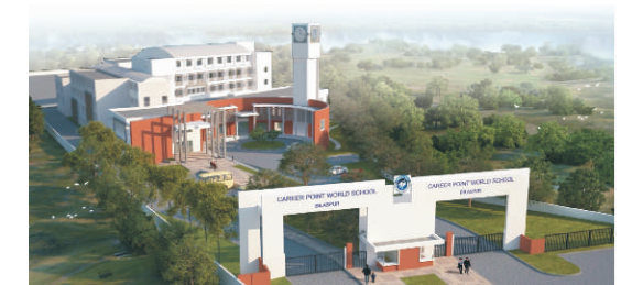
Career Point World School, Bilaspur