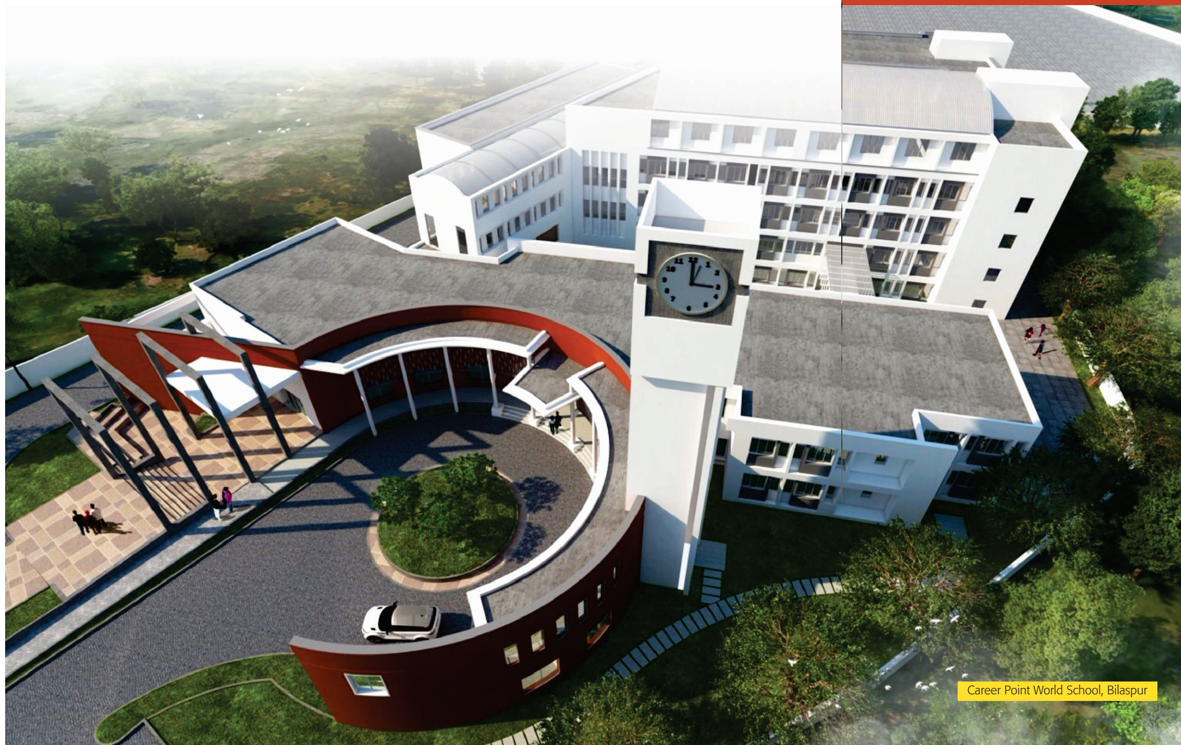
Career Point World School, Bilaspur