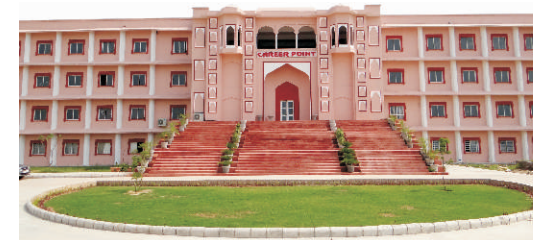
Career Point Technical Campus at Mohali, Chandigarh